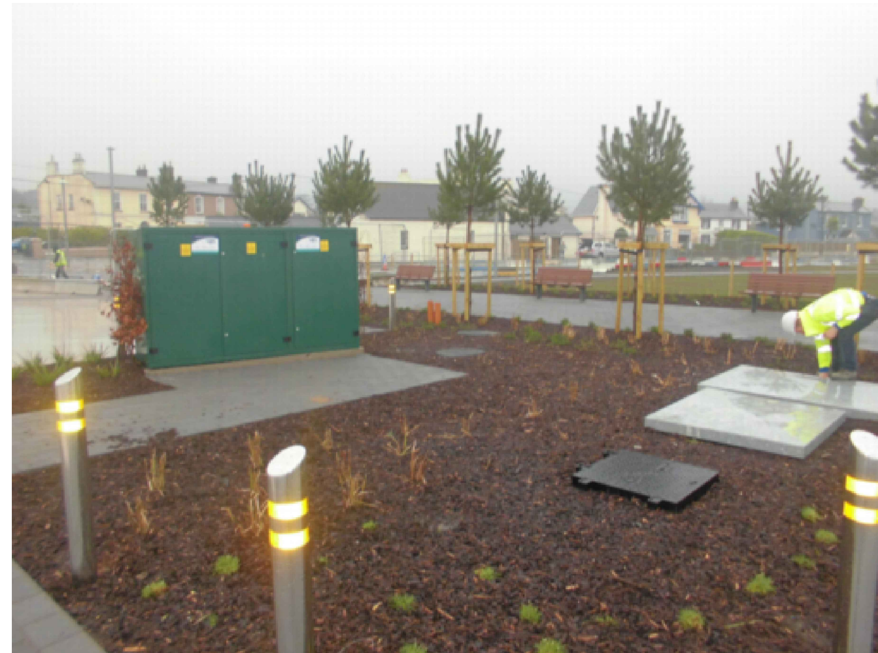
IMAGE 001 - FOUL PUMPING STATION EXAMPLE